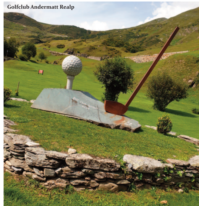
Golfclub Andermatt Realp