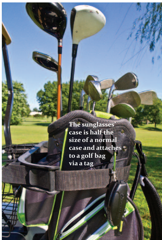
The sunglasses case is half the size of a normal case and attaches to a golf bag via a tag

Appreciating that the ladies' apparel is a different market, the company has done its research and I wouldn't be surprised to see it out-sell other leading brands in the future